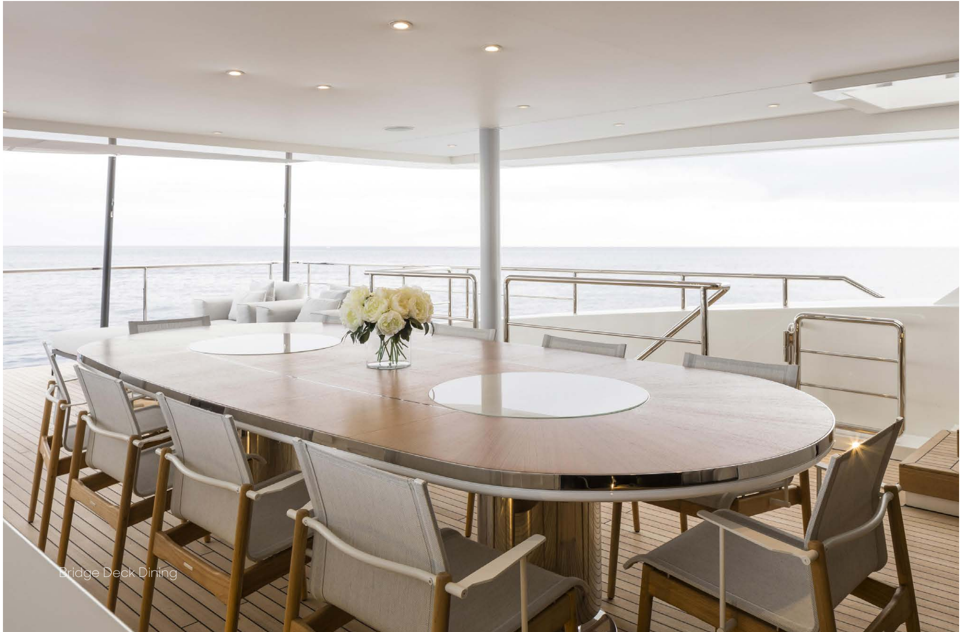
Bridge Deck Dining