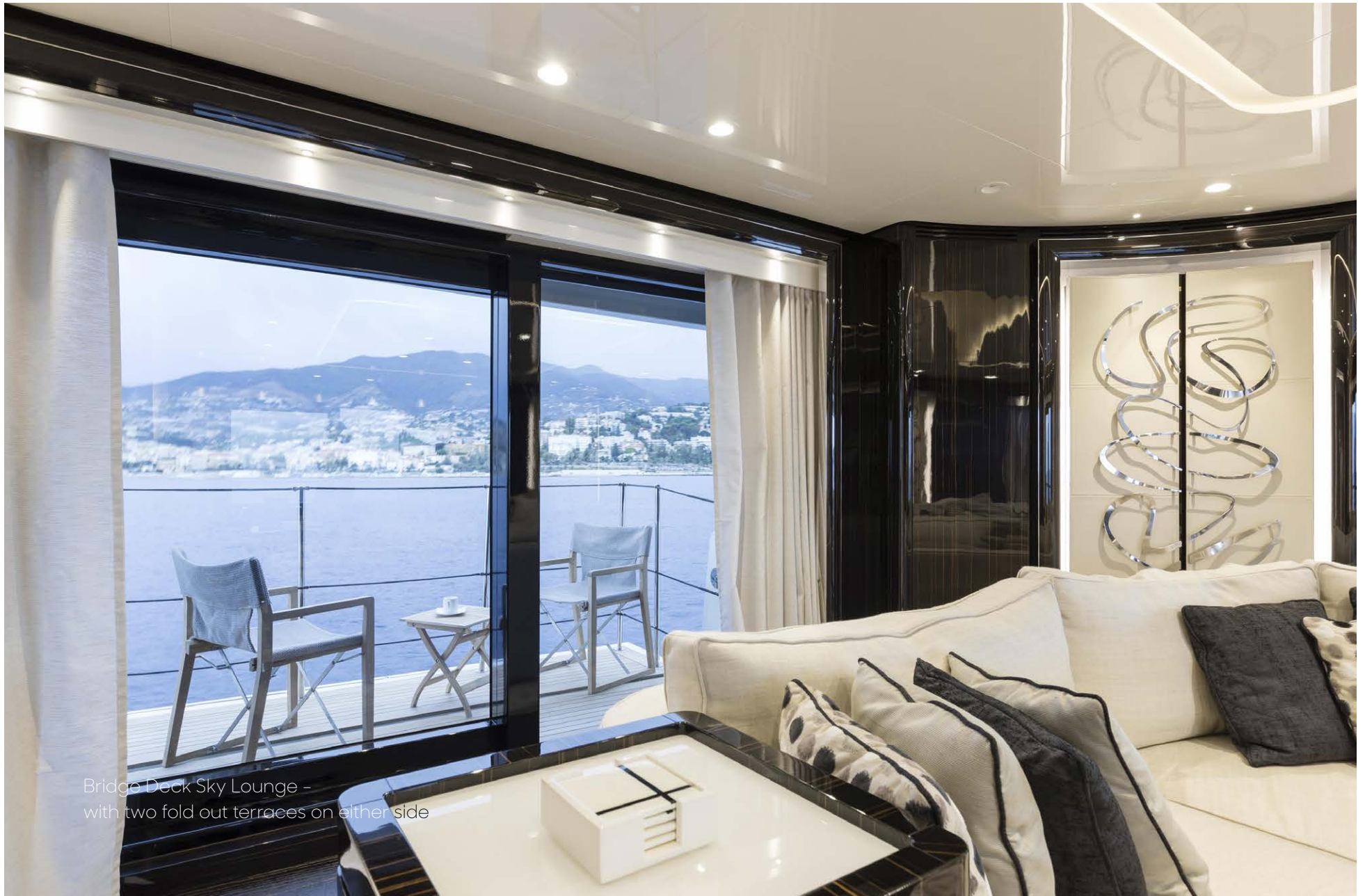
Bridge Deck Sky Lounge - with two fold out terraces on either side