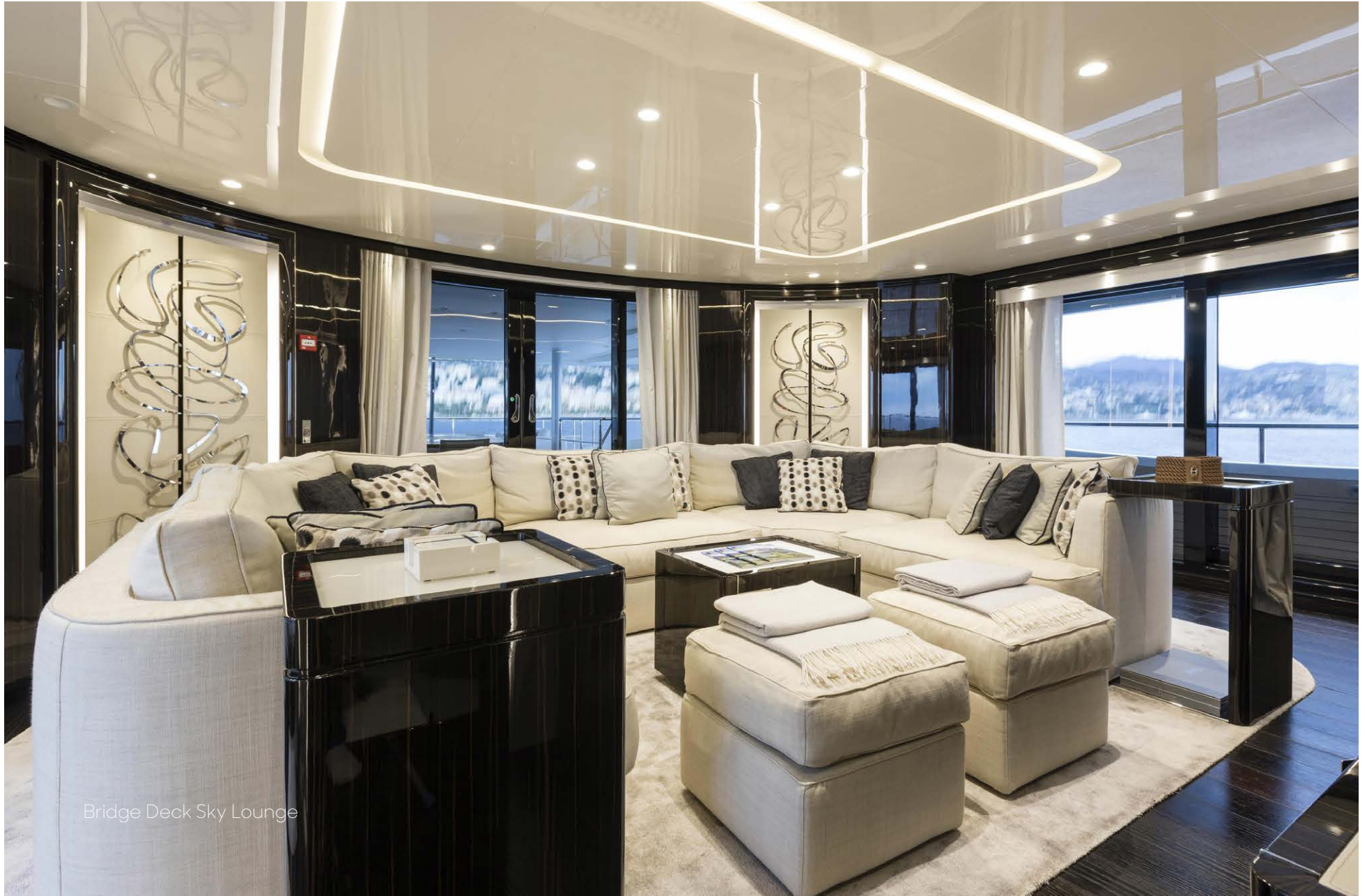
Bridge Deck Sky Lounge