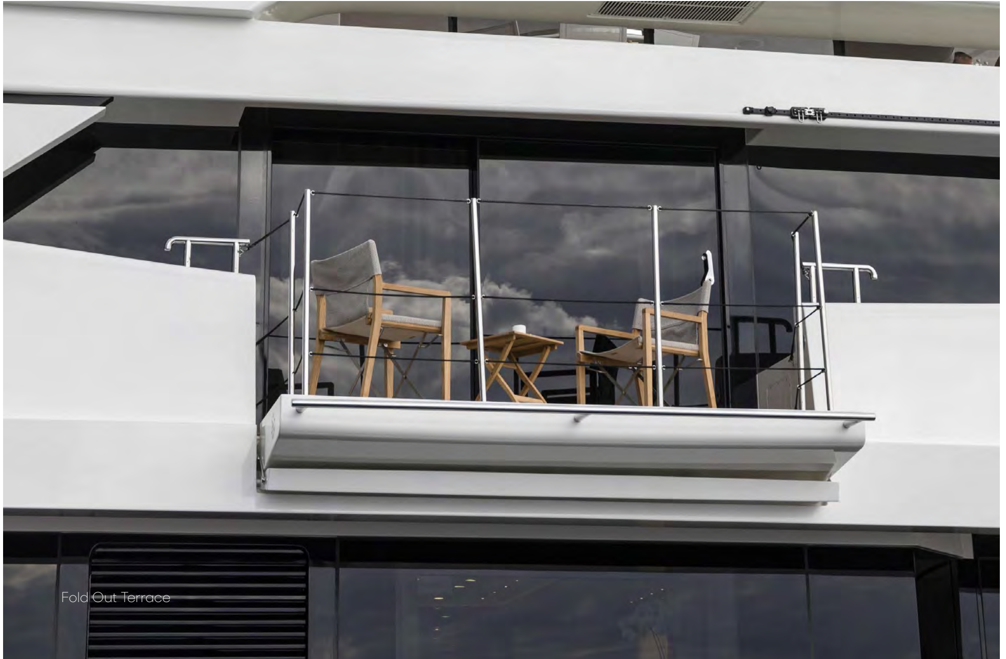
Fold Out Terrace